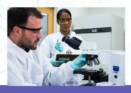
Highly Competent Laboratory Workforce

Improve the quality and value of laboratory medicine and biorepository science for better health outcomes and public health surveillance