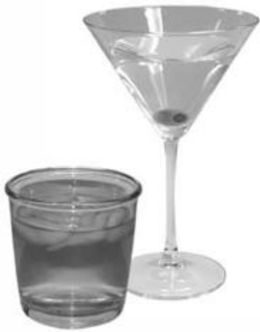
1 Shot of Liquor (Whisky, Vodka, Gin, etc.) 1.5 oz.