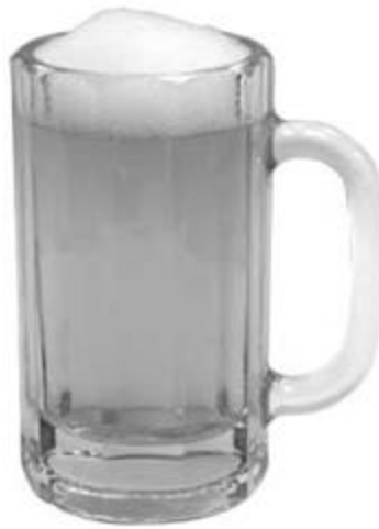
1 Regular Beer 12 oz.