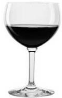
1 Glass of Wine 5 oz.