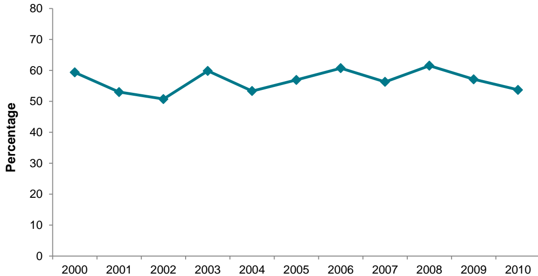
Figure 4. Percentage of pregnant women tested for HIV in the last 12 months, NHIS, United States, 2000-2010

Note. The percentage of pregnant women tested for HIV in the last 12 months did not change significantly from 2000 to 2010 ( p=0.6554 ).