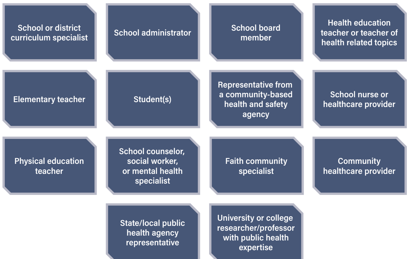
Figure 2. People who might serve on a Health Education Curriculum Review Team

Figure 2 lists the type of people who may be considered as members of a health education curriculum review team.