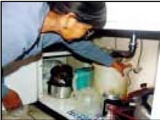
Look for holes.