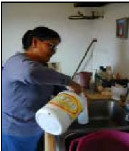
Bleach and water solution

Do not sweep or vacuum up mouse or rat urine, droppings, or nests. This will cause virus particles to go into the air, where they can be breathed in.