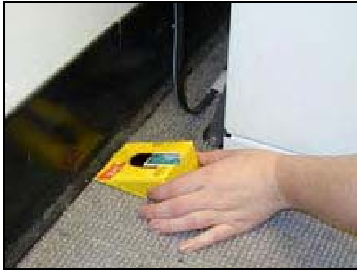
Place bait where you have seen mice or rats