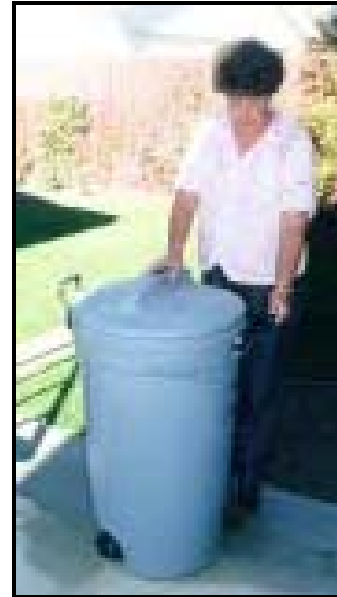
Use a trash can with a tight lid