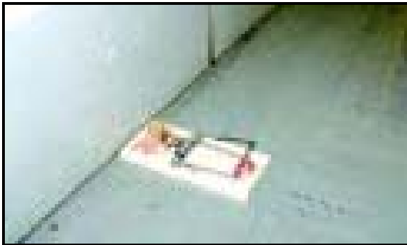
Place trap so it makes a "T" with the wall