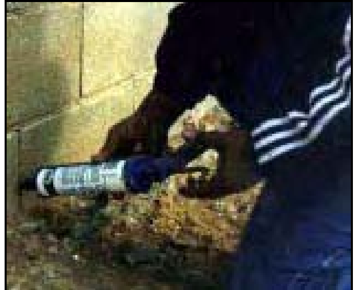
Seal holes with caulk