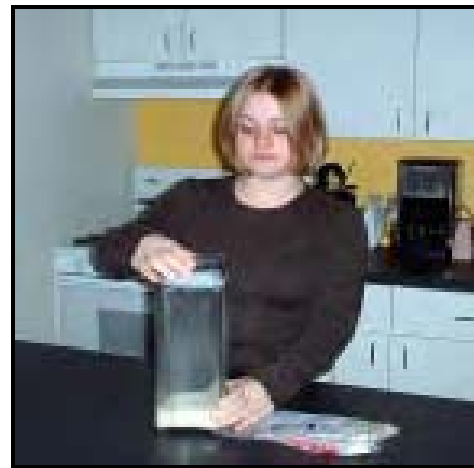
Store food in containers with lids.