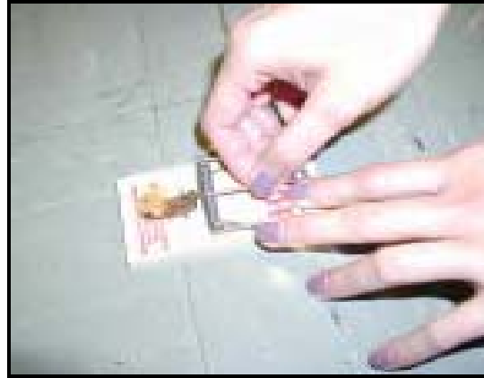
Use peanut butter on traps.