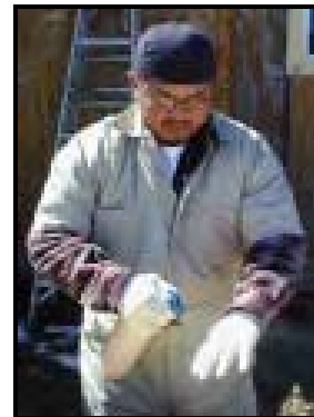
Spray gloves before taking them off