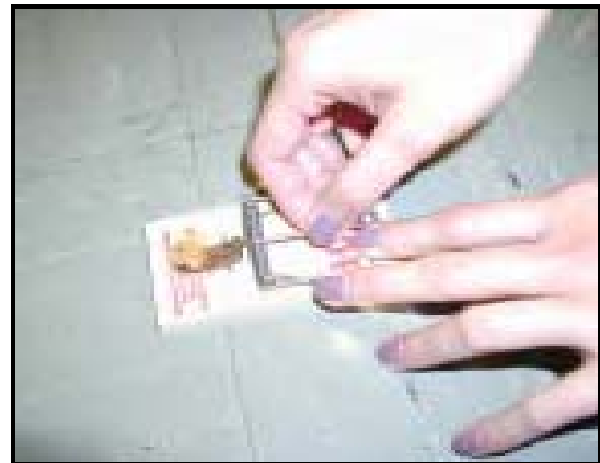
Use peanut butter on traps.