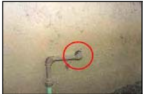
Look for gaps around pipes outside your home