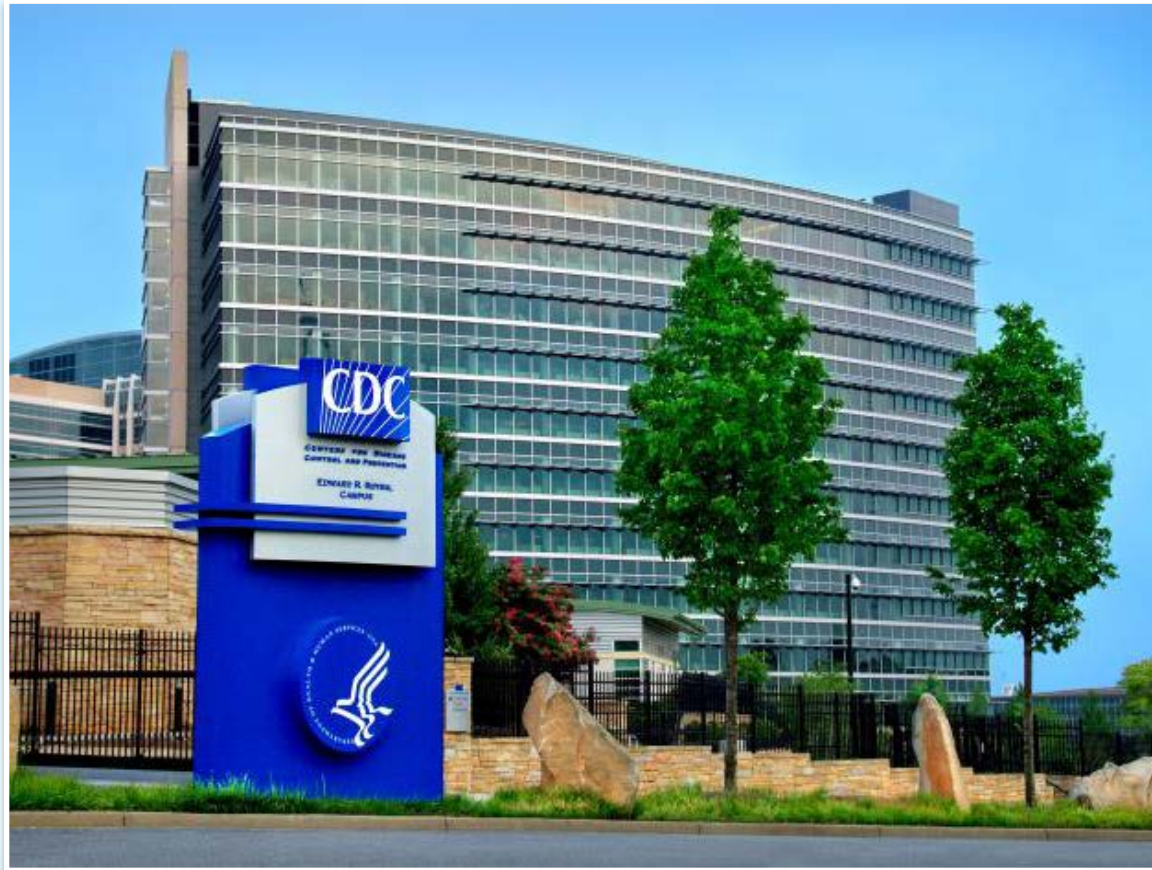
Centers for Disease Control and Prevention (CDC). Prioritize and Control Public Health Problems. Atlanta, Georgia: Centers for Disease Control and Prevention (CDC); 2013.