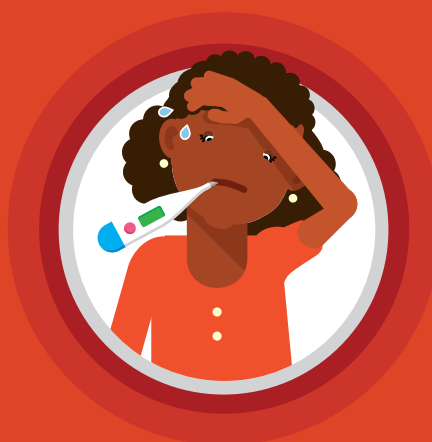
Fever higher than 102°F