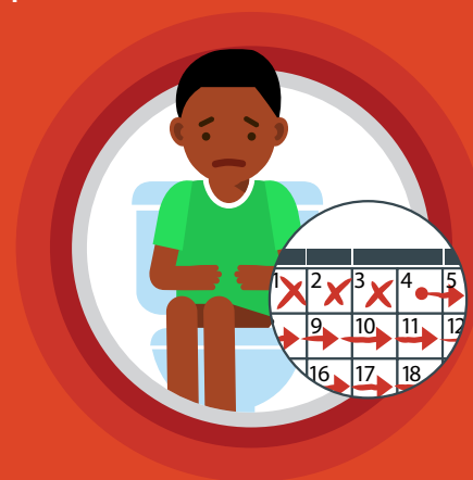
Diarrhea for more than 3 days