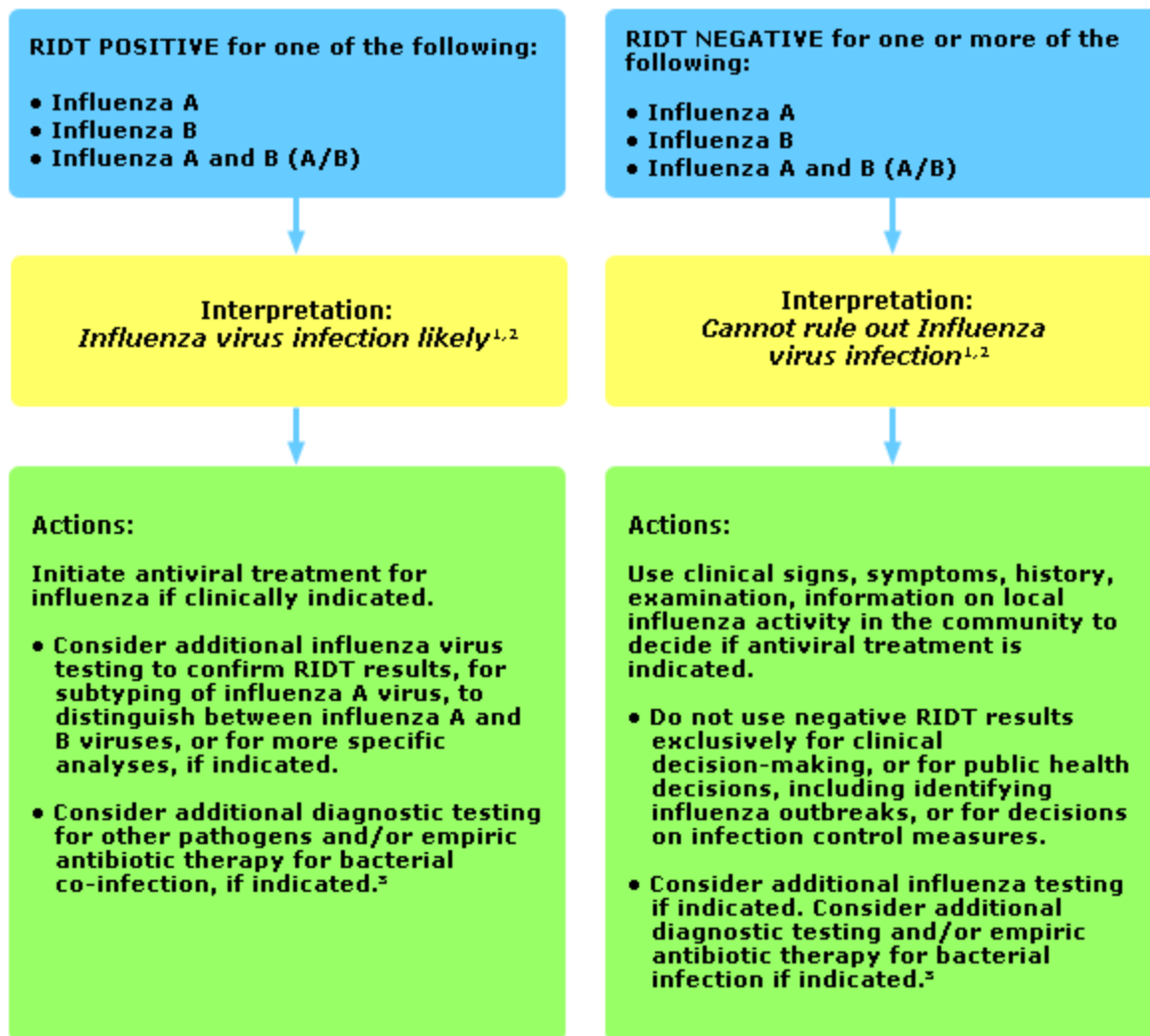
Figure 3: Algorithm to assist in the interpretation of RIDT results and clinical decision-making during periods when influenza viruses are circulating in the community 1

In Figure 3, if the RIDT is POSITIVE for one of the following: Influenza A, Influenza B, or Influenza A and B (A/B) then the interpretation is Influenza virus infection likely . 1,2 Actions are to initiate antiviral treatment for influenza if clinically indicated. Consider additional influenza virus testing to confirm RIDT results, for subtyping of influenza A virus, to distinguish between influenza A and B viruses, or for more specific analyses, if indicated. Consider additional diagnostic testing for other pathogens and/or empiric antibiotic therapy for bacterial co-infection, in indicated 3 .