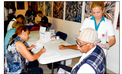
Colombian Consulate Vaccination Clinic Miami, Florida.