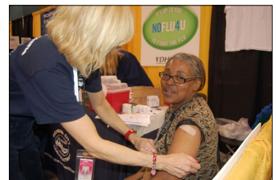
CBS affiliate WTVR and Virginia Commonwealth University Medical Center sponsor flu vaccine clinic in Richmond.