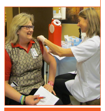
Akwesasne Mohawk Casino Resort employee receives her flu vaccination.

The Mohawks of Awkwesasne reside on over 30,000 acres of beautiful tribal land extending from New York into Quebec and Ontario. Nestled between several small rivers, as well as the St. Lawrence River, the casino is one of the largest employers not only of the local community but of the Northern New York region. The flu vaccination promotion event is one way that the casino gives back to their community in addition to making charitable donations from their profits.