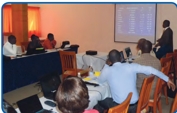
Influenza Surveillance Network Annual Review Meeting in Bouake, February 2013.

An awareness and communication tour was held for the general public on high-risk behavior and influenza prevention. Two campaigns were conducted in February 2013: (i) in the towns of Abengourou, Bondoukou, Bouna and Nassian (ii) in Korhogo, Ferke, Tengrela and Boundiali. Four hundred (400) persons at the community level, as well as political, administrative, traditional, and religious, and civil society participants and authorities were invited to the meetings.