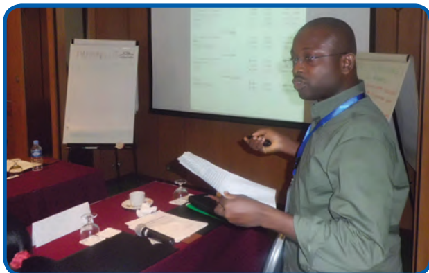
Regional Training Workshop on Influenza Data Management and Scientific Writing, Abidjan, May 2013.