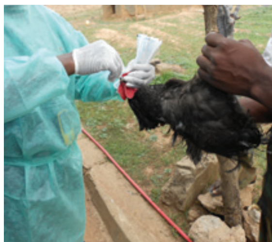
Sampling from domestic poultry for influenza viruses, Ghana.