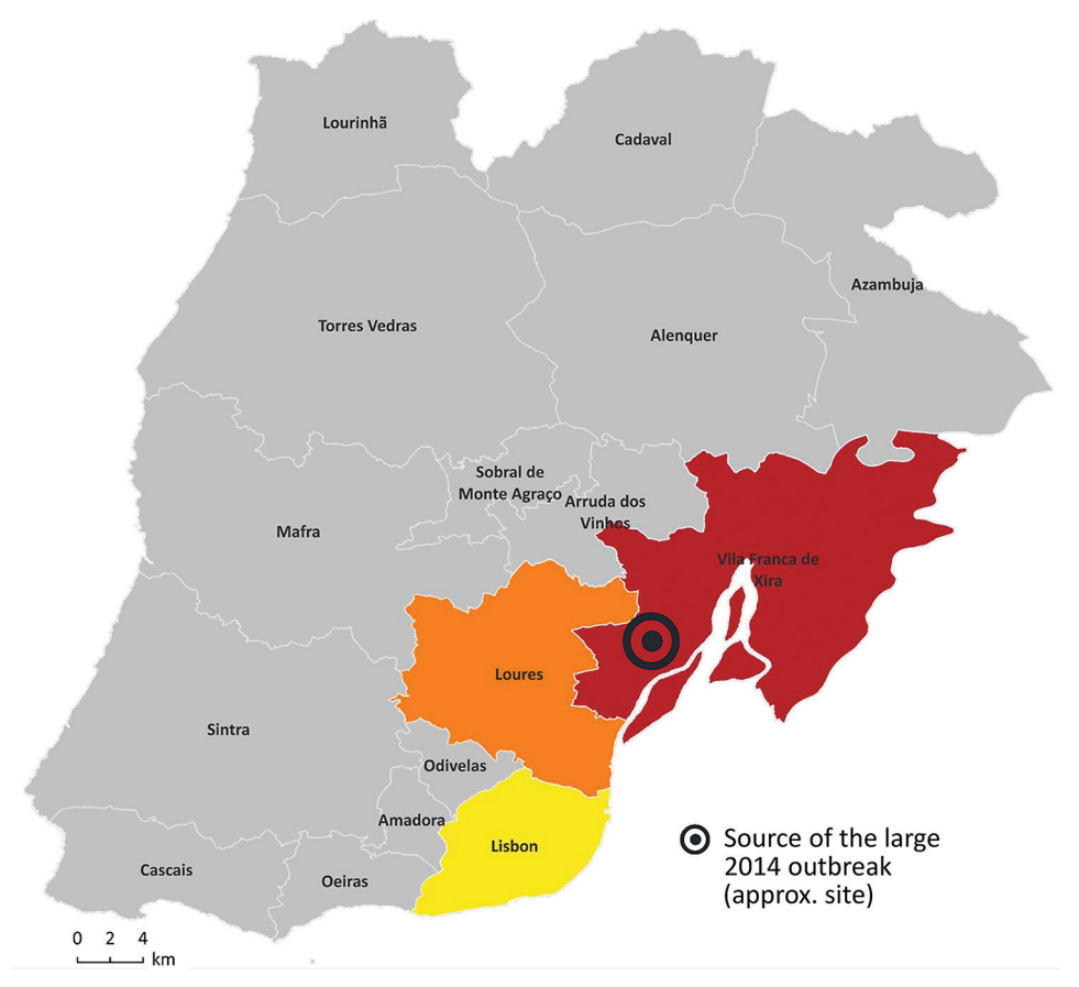
Figure 1. Geographic spread of 12 Legionella pneumophila sequence type 1905 isolates by probable municipality of exposure (clinical) or sampling (environmental), Lisbon region, Portugal, 2014–2022. Location of 2014 Legionnaires' disease outbreak is indicated.

tig 8, PtVFX/2014_08985-08995) belonging to the type IVA secretion system, which is associated with the survival of the bacteria in the environment (11). Of note, Lpn_PT_E259_y2021, isolated from a sporadic LD case, presented mutational events, including 2 deletions and 1 insertion, not found in any other isolates included in this study. The first deletion encompasses a 45,479-bp segment (contig 8, PtVFX/2014_09080-09280) that includes an ≈37.5-Kb genomic island containing an lvh/lvr type IVA secretion system cluster. That cluster was first identified within the L. pneumophila species in the PtVFX/2014 strain (PtVFX/2014_09115-09280), possibly because of interspecies transfer from L. oakridgensis (3). The second deletion spanned 142 bp and occurred in a CRISPR-associated intergenic region (PtVFX/2014_08935/08940). Moreover, we observed a frameshift 25-bp insertion at the Pt-VFX/2014_13190 locus, coding for a protein with unknown function. That locus seems to be specific for L. pneumophila subsp. fraseri and is located within a larger genomic region that contains known Dot/Icm substrates (3). Although we cannot make