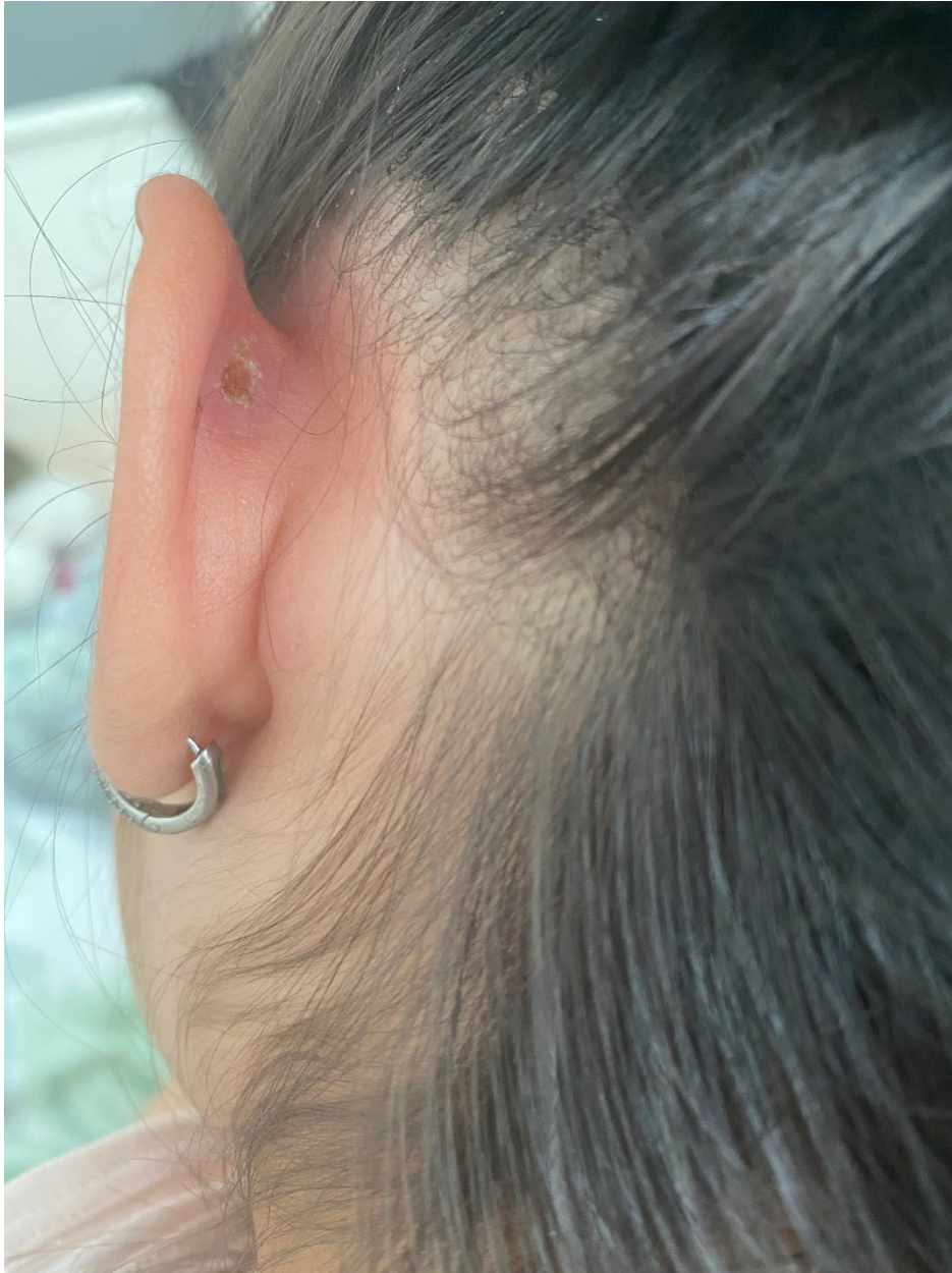
Appendix Figure. Swollen and reddened pinna, with pus-covered 5-mm retroauricular skin lesion with a central ulcer in 5-year-old girl with tick-borne tularemia, Austria.