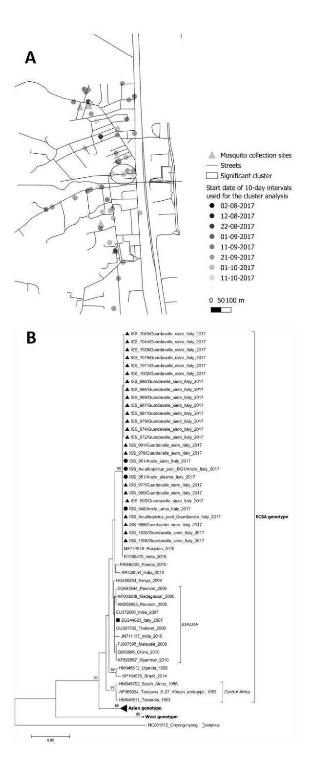
Appendix Figure 2. A) Cases in Guardavalle Marina, Italy, 2017, gray-scale coded by 10-day intervals with clustering analyses (circles) and mosquito collection sites (triangles). B) Neighbor-joining phylogenetic analysis of sequences derived from 22 chikungunya virus—positive samples from patients and from 1 pool of mosquitoes from Guardavalle Marina, Italy, August-October 2017.