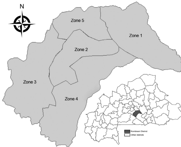
Figure 1. Zones within Kombissiri district, Burkina Faso.

epidemic response guidelines in use at the time and up to 2 weeks earlier by using 2014 guidelines. At the district level, the short time between crossing the epidemic threshold and attaining the epidemic peak (average <1 week) leaves a limited window for effective intervention because reactive immunization has a moderate effect on natural epidemic evolution after an epidemic has peaked (12). In this epidemic, the time between crossing the epidemic threshold and reaching peak was much longer when characterized at the zone level (3 and 10 weeks, respectively, in the 2 outbreak epicenters). Characterizing the epidemic risk at the subdistrict level with the 2014 alert threshold for a population of \approx 30,000 yielded critical time gains, particularly during the epidemic preparedness phase. Early interventions with longer implementation windows improve response efficiency and might have halted this epidemic before it spread throughout Kombissiri. Timelier, targeted interventions could potentially be mounted at district or even subdistrict levels if the epidemic risk is localized. Too little evidence is available now to consider