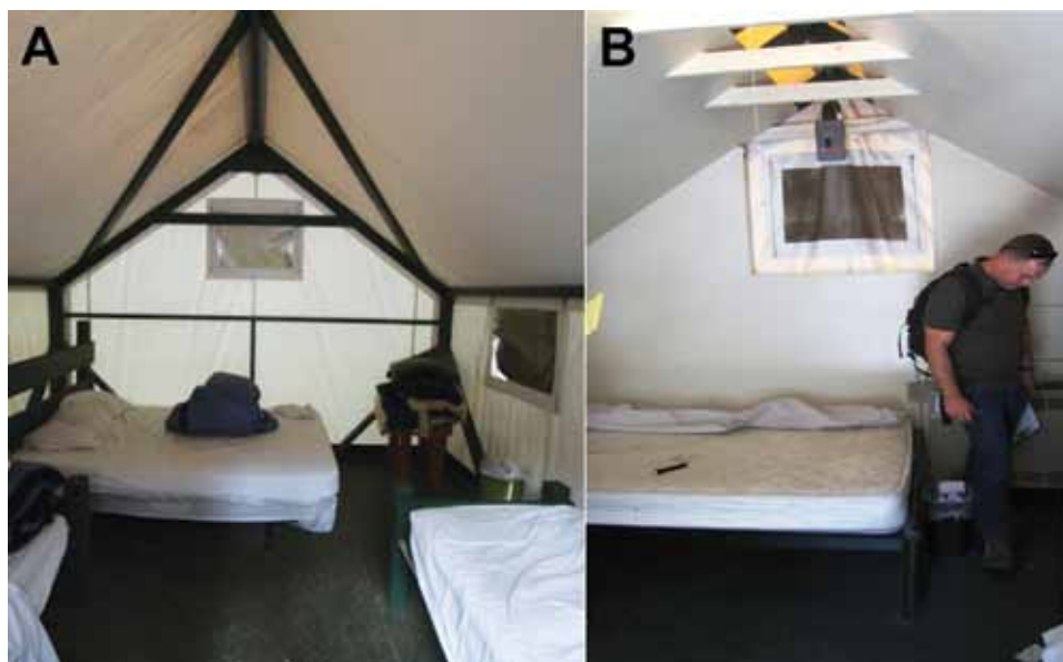
Figure 3. Inside view of regular and signature tent cabins, Yosemite National Park, summer 2012. A) Regular tent cabin showing canvas affixed over a wood frame. B) Signature tent cabin showing drywall between the exterior canvas and the interior living space.

educational materials were handed to every park visitor, and educational messages were posted in public areas, in lodgings, and on the park Internet site. Additional hantavirus awareness and prevention training sessions were provided to employees and volunteers within the park and NPS-wide. CDC developed an Internet page specific to the outbreak and added staff to its toll-free hantavirus hotline.