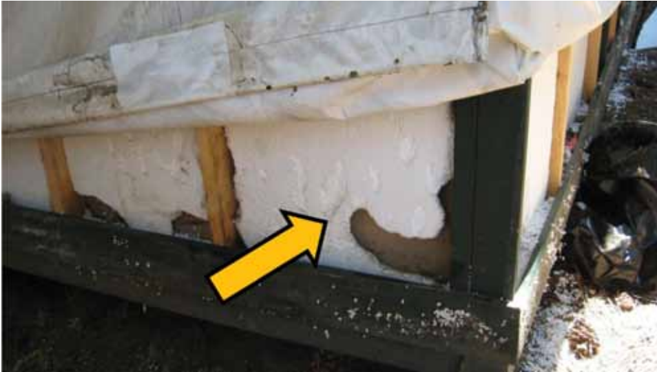
Figure 4. Damage from rodents tunneling in the foam insulation of a signature tent cabin, Yosemite National Park, summer 2012.

was active at Curry Village in summer 2012. This population, however, appeared to be substantially lower in September (trap success 14%), after the signature tent cabins were closed in late August and rodent control measures were implemented. The presence of SNV (14% seroprevalence) among these deer mice was comparable to the 16% seroprevalence reported previously in deer mice trapped at similar elevations in California (19).