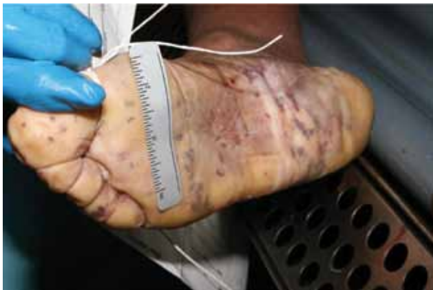
Figure 1. Postmortem purpuric rash on sole of a man for whom invasive meningococcal disease was diagnosed after death (case 1), New York City, New York, USA.

Clinical, PCR, and IHC findings were all consistent with invasive meningococcal disease. All close contacts of the patient were located and given prophylaxis. No secondary cases were identified.