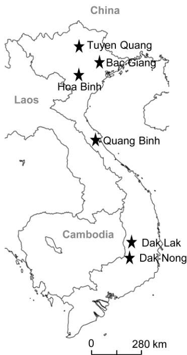
Technical Appendix Figure 1. Bat study sites in Vietnam, 2007–2008.