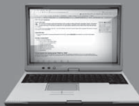
Table of contents Podcasts Ahead of Print CME Specialized topics