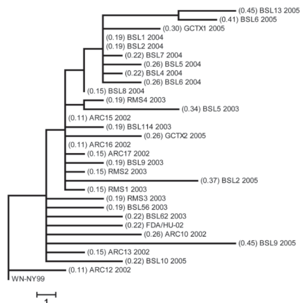
Figure 1. Phylogenetic analyses based on maximum parsimony comparing the 2,685-bp nucleotide sequence, including the complete structural and the 5'-untranslated region of prototype West Nile virus (WNV) strain WN-NY99 with 30 WNV isolates collected during the 2002–2005 epidemics in the United States. Values in parentheses show percentage of nucleotide sequence divergence from WN-NY99. Scale bar represents a 1-nt change.

The env protein has several biologic roles, which include viral entry, virion assembly and release, agglutination of erythrocytes, and induction of B- and T-cell responses that are associated with protective immunity. Thus, this protein may be involved in WNV evolution. The phylogenetic tree shown in Figure 2 was constructed by maximum parsimony analysis with env gene sequences from US isolates from 1999–2006 in GenBank and sequences of