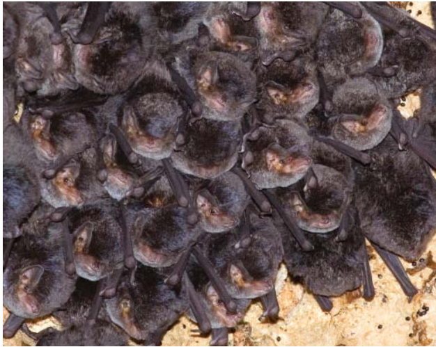
Figure 2. Colony of Miniopterus minor bats in cave.

isolate is available to date. Seroprevalence to this virus in African Miniopterus bats is intriguing. Perhaps WCBV and similar viruses are specifically associated with Miniopterus bats and distributed quite broadly. Miniopterus bats are common in the tropics and subtropics of the Old World (15). They segregate into large colonies in caves. For example, in Kenya, Miniopterus colonies consisted of thousands of bats. Many of these caves are regularly visited by local residents and by tourists. Although no data exist for WCBV pathogenicity in humans, the absence of reliable vaccine protection against this virus and the ability of WCBV to cause fatal encephalitis in animal models (7) suggest the need for improved surveillance and public education to avoid exposure to bats.