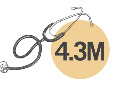
4.3 million Americans engaged in non-medical use of prescription opioids in the last month.<sup>2</sup>