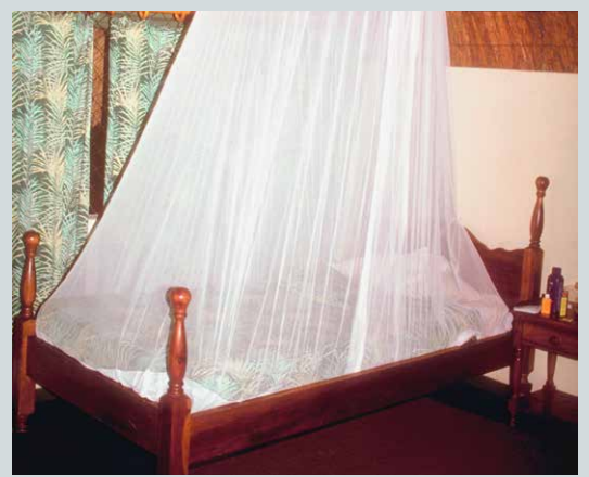
Cover sleeping areas to keep away mosquitos.