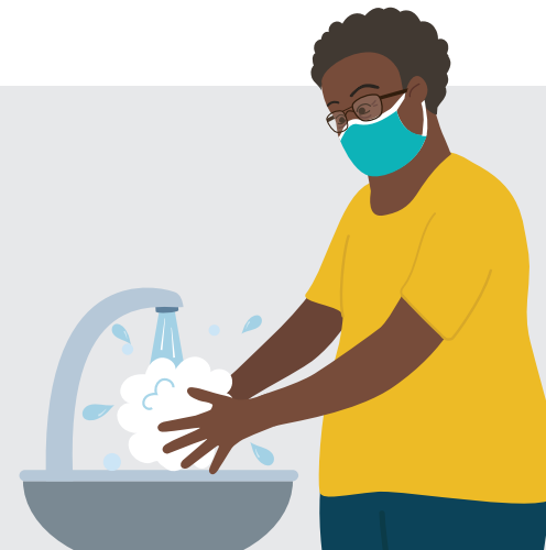
Wash my hands