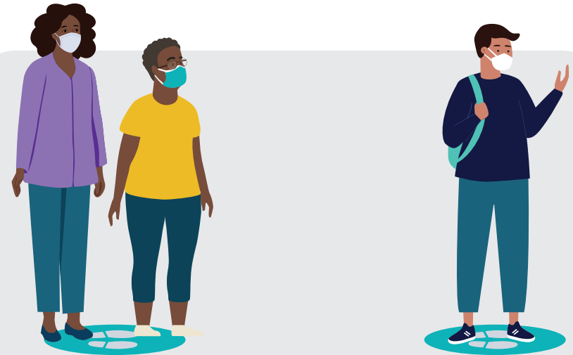
Keep a safe distance from other people