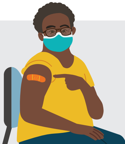
Get a COVID-19 shot