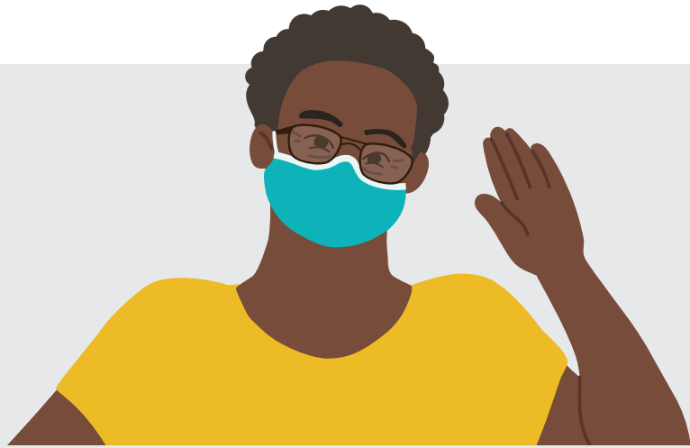
Wear a mask