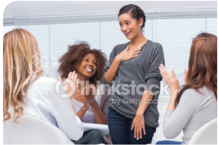
Better diagnosis and treatment can improve mental health among women of reproductive age.

Age 15-44 is considered "reproductive age."