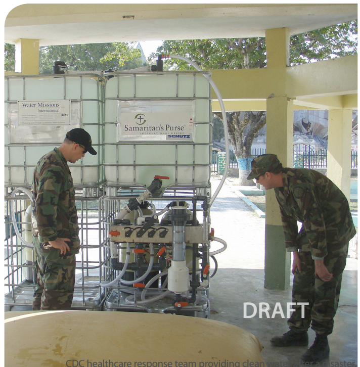
CDC healthcare response team providing clean water to a disaster area.

National Center for Environmental Health Division of Emergency and Environmental Health Services