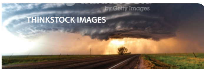
Caption dependent on event photo.

“The concepts covered during the EHTER course,” Snyder says, “were very helpful during the emergency and our subsequent response activities...we hope to secure the same training for all county environmental health staff as well as other public health staff and emergency responders.”