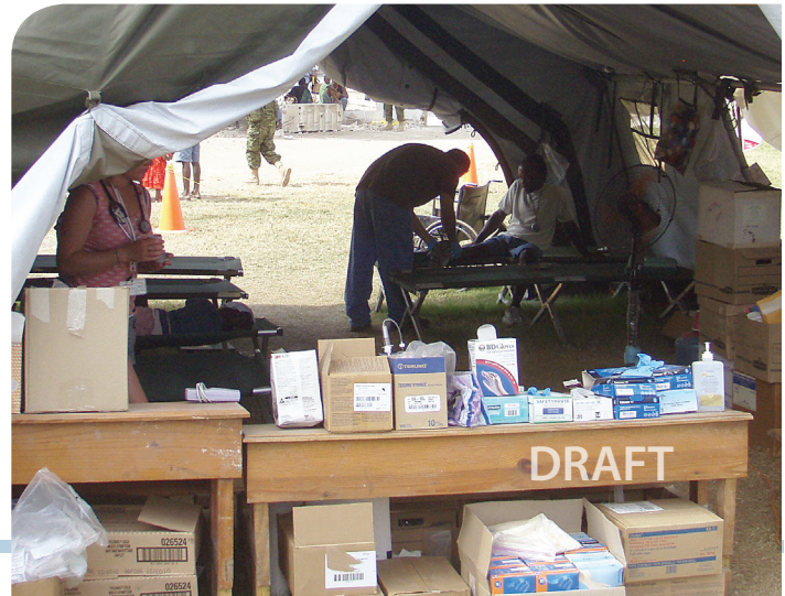
CDC healthcare response team providing supplies to a community.

Environmental health practitioners and others should sign up now for the Environmental Health Training in Emergency Response (EHTER) to learn how to respond to environmental health threats during disasters.