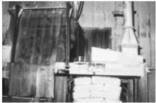
Figure 3. Photograph of modified semi-automated palletizing machine