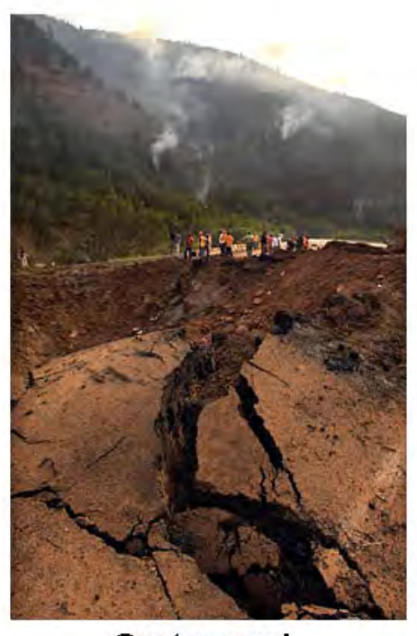
Crater and damaged roadway