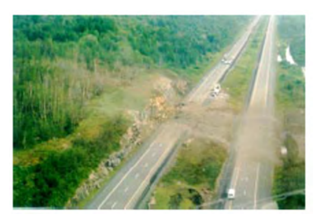
Figure 1. Site of explosives truck accident in Walden, Ontario.

On August 5, 1998 an explosives truck consisting of a tractor and trailer carrying 18,000 kg (40,000 lb) of blasting explosives went off the road near Walden, Ontario, Canada<sup>5,6,7</sup>. A fire started immediately. Drivers passing by stopped and helped the driver exit the truck and took him to safety. Explosive placards and the driver's warning alerted people to the hazard and they evacuated the site. The truck exploded about 35 minutes after the accident. The explosion caused two minor injuries, threw fragments of the truck up to 2,740 m (5,800 ft), and damaged several houses. At the time the truck exploded firefighters were in contact with the Canadian Transport Emergency Centre (CANUTEC) and were advised against approaching the scene. Evacuation of the accident site prevented any fatalities or serious injuries. The accident scene is shown in Figure 1.