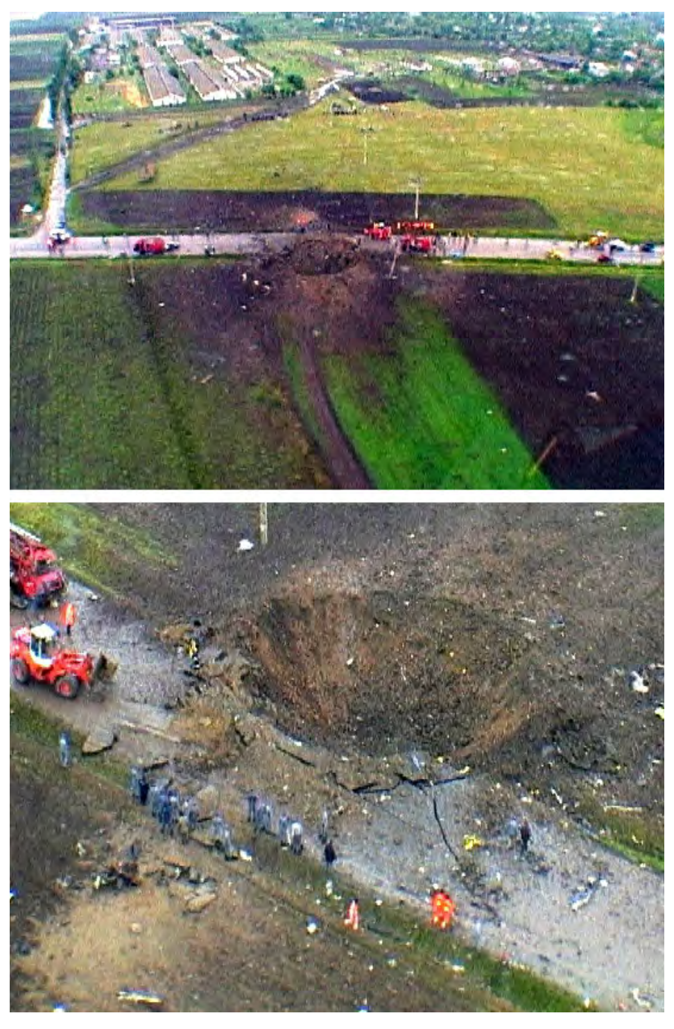
Figure 4. Accident in Romania in which 20 MT (22 t) of "nitrous fertilizer" caught fire and exploded, killing 20 people.