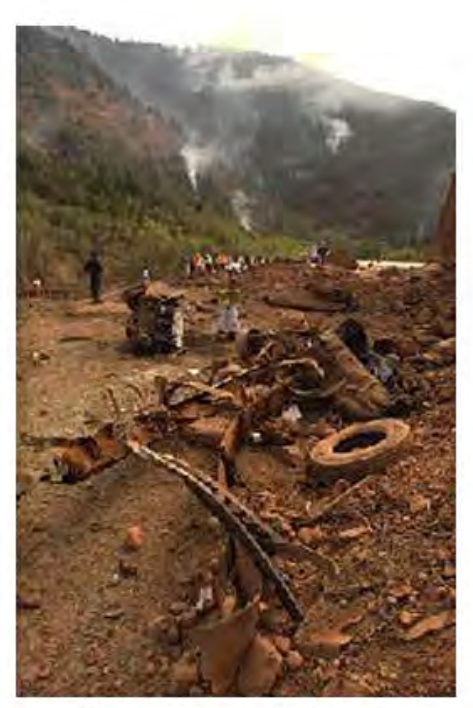
Remains of truck