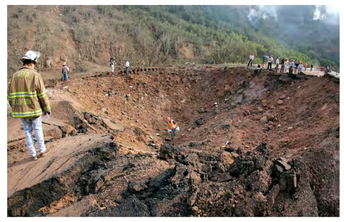
Crater, 20-35 feet deep