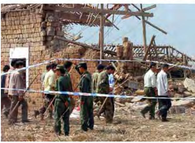
Figure 5. Damage caused by the 2005 explosion of an 18-MT (19.5-t) truckload of AN in Zhenganzhai, China.

The accidents above all occurred outside of the U. S. Table 1 lists five industrial explosives transport accidents in the U.S. None of the U.S. accidents resulted in fatalities. (There was a fatal accident involving Division 1.3 fireworks but the authors have limited this discussion to explosives used in industrial applications.) The worst accident was the explosion of 16,102 kg (35,500 lb) of explosives along Route 6 in Utah in August, 2005<sup>15</sup>. The truck driver apparently lost control of the truck on a curve and the truck tipped over and caught fire. Cars stopped and passengers rescued the driver and co-driver from the truck. The driver told his rescuers that the truck was carrying explosives. People were in the process of moving everyone away from the accident scene when the truck exploded. The explosion produced a crater 9 m (30 ft) deep and 21 m (70 ft) wide. The driver and co-driver were hospitalized. Seventeen others were injured but most were not serious; two were hospitalized. The response to this accident was consistent with the guidelines in USDOT ERG; people were evacuating the accident site as quickly as possible.