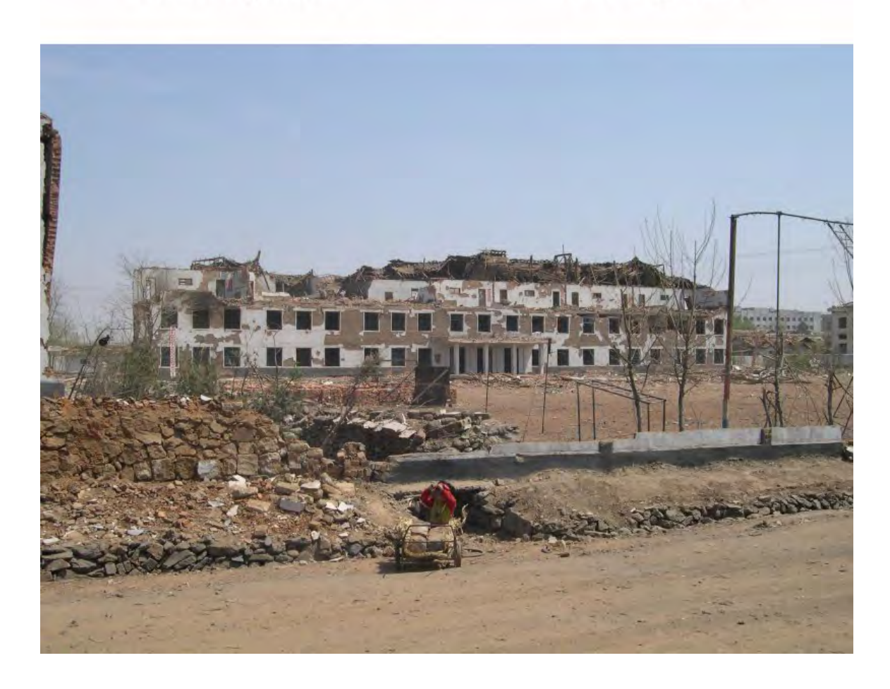
Figure 3. Ryongchon Primary School was severely damaged by the train explosion.