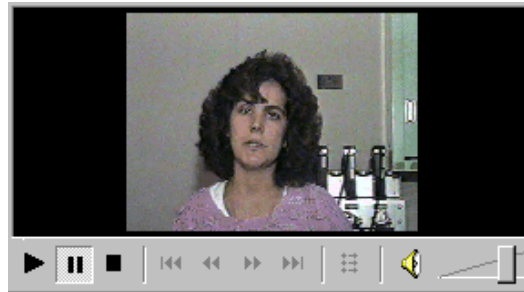
Figure 3 - Multimedia enhancements. An angry spouse "interrupts" the command center, appearing via digital video.

At times, the Host PC may generate problems that interrupt the trainee and demand immediate attention. For example, if the trainee has not addressed site security, a distraught member of an underground miner's family might appear at the command center, depicted by a digital video (figure 3). The trainee will be unable to address other issues until the family member is calmed and moved to an appropriate facility away from the command center. These interruptions provide a sense of realism by exposing the trainee to problems that can occur in an actual emergency.