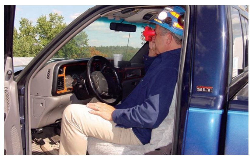
Clockwise from top left: Photo 2: Invisible ink training exercise example. Photo 3: 3-D viewer and slide reel. Photo 4: Driller looks at 3-D reel before his shift.

comments and recommendations were considered and selectively integrated into the exercises.