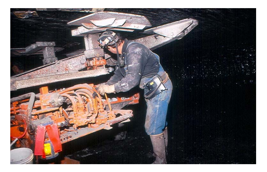
Figure 1. A miner wearing the PDM.

Mining Association, Thermo Fisher Scientific Inc. and the Mine Safety and Health Administration (Figures 1 and 2). This new device represents a major advance in the tools available for assessing coal miners' exposure to respirable dust levels.