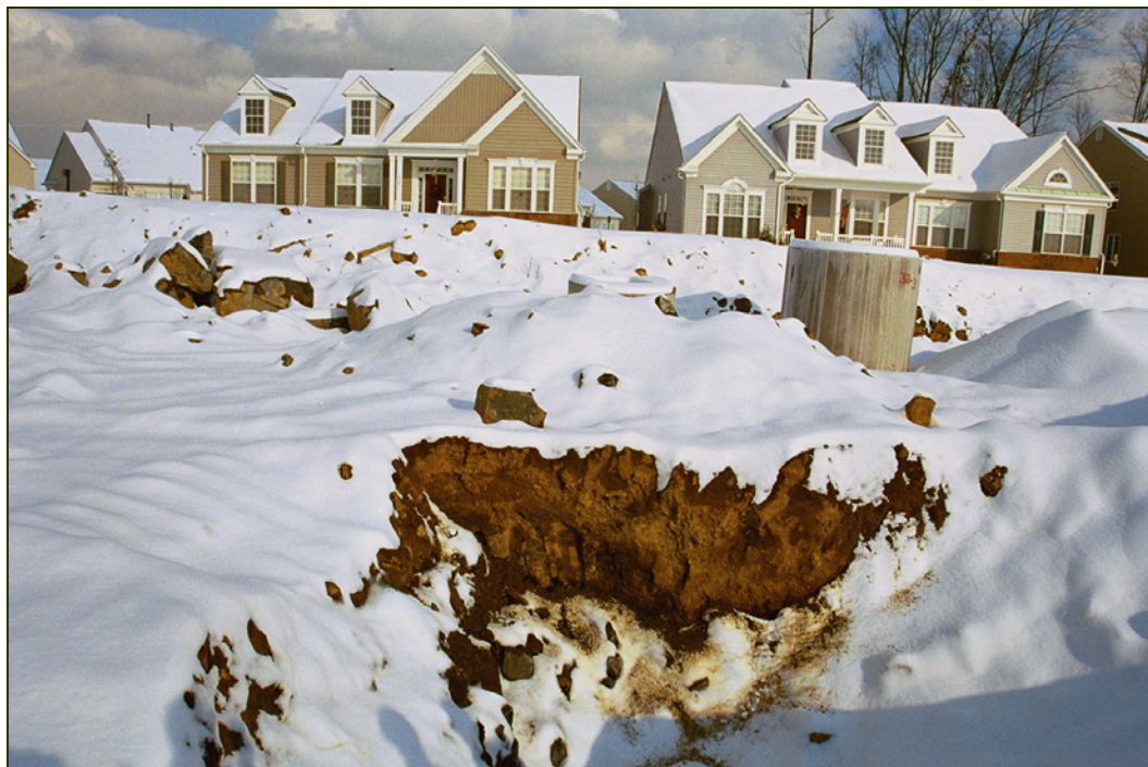
Figure 2 - The first of four pits dug at the location of the trench blast in an effort to vent CO. Homes 1 and 2 can be seen in the background.