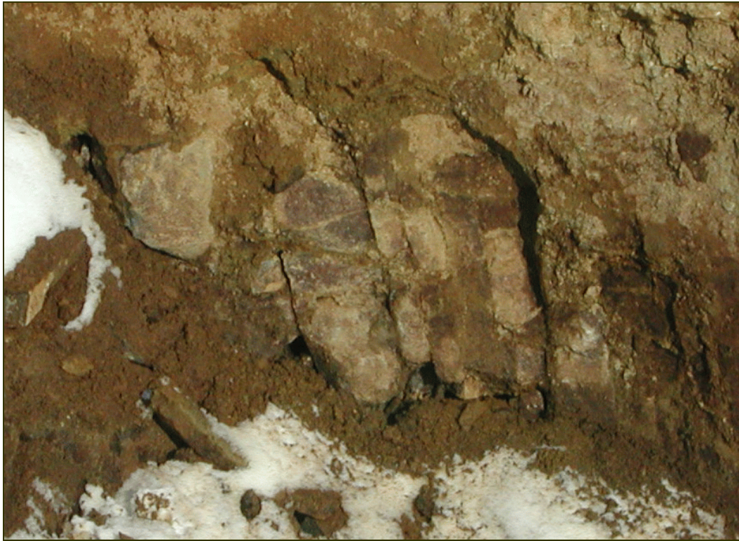
Figure 3 - A close-up of the bedrock seen in Fig. 2. Note the fractures are oriented towards nearby homes.