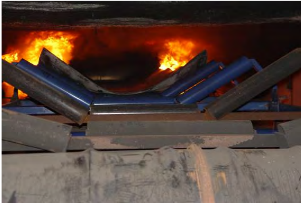
Figure 8. A conveyor belt fire experiment in fire gallery

investigated variables that contribute to the self-heating process and developed a laboratory test method to predict the potential for spontaneous combustion (Smith and Lazzara 1987).