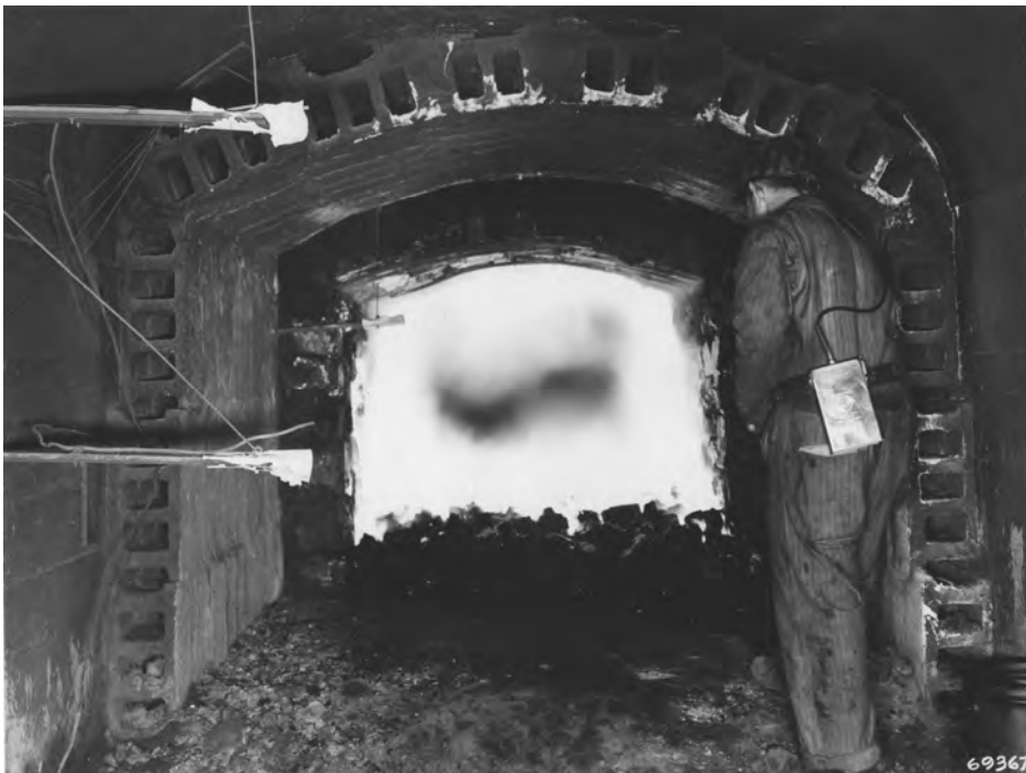
Figure 5. A 15-ton coal fire prior to extinguishment with high-expansion foam

In the early 1950's, the Bureau conducted extensive studies on the fire resistance of conveyor belting, hydraulic fluids and electrical cables to determine their fire hazards. An important milestone was reached in 1955 when the Bureau prescribed a schedule of acceptance requirements for fire resistant conveyor belting (Schedule 28). By 1958, 60 conveyor belts were accepted as fire resistant. Flame resistance tests were also conducted on 20 electrical cables and on fire resistant hydraulic fluids, and the first testing on frictional ignition of conveyor belts was completed. In 1958, suppression tests of high expansion foam plugs to extinguish large-scale coal and mining machinery fires were started at Bruceton, Pa. Figure 5 shows a coal mine fire in the Bruceton Experimental Mine just prior to extinguishment. By 1960, the Bureau had completed six extinguishment tests of 15 ton coal fires and demonstrated the results to the coal industry. This resulted in the employment of portable foam generators at mines throughout the United States (Nagy et al 1961).