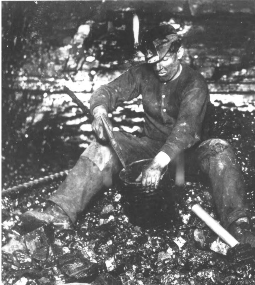
Figure 1. Miner with open flame cap lamp for illumination

ventilation in the working areas, the guarding of trolley wires, fireproofing of shaft stations, and the use of wire rope to replace hemp rope (Rice 1912). Prior to 1941, the Federal government was prohibited from inspecting mines or enforcing recommendations. After the Cherry Mine disaster, the state of Illinois drafted the most complete code for fire protection in mining at the time. This code included the need for adequate fire-fighting equipment, including hose lines, water tanks and hydrants, portable extinguishers, telephone and alarm apparatus, breathing apparatus, ventilation fans, and mine fire escape plans.