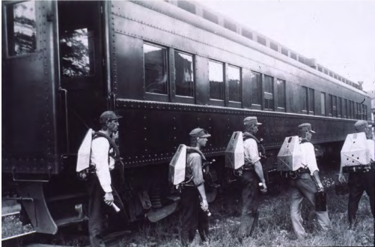
Figure 2. Bureau of Mines mine rescue and training car

By 1921, the Bureau's role in fires was still primarily as an accident investigations branch with no dedicated fire research program. As a result of World War I, several new areas of interest emerged. A program on metal dust fires studied the fire hazards of shipping metal dusts, including aluminum and zinc. The use of gas masks, developed in large part by the Bureau for the Army during the war (Farrow 1920), was examined for use in fighting fires. Of course, the filters removed smoke particles, but did not remove carbon monoxide or provide oxygen. This led to research on carbon monoxide filters and to the development of carbon monoxide detectors. It was found that carbon tetrachloride and foamite fire extinguishers, typical of the time, produced hydrochloric acid and phosgene (Fieldner and Katz 1921). Studies continued on spontaneous combustion during coal storage (Hood 1922). It was determined that coal characteristics such as coal type, moisture content, and pile size contributed to the spontaneous combustion hazard. Other research findings during the 1920's included the determination that rock dust could readily extinguish a coal fire when the miner was able to fight the fire directly (Howarth and Greenwald 1927), and that a hot surface could ignite methane (Leitch et al 1925).