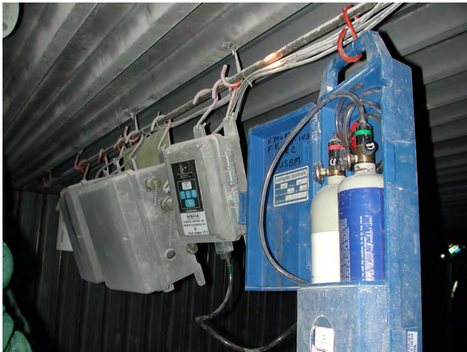
Figure 9. “Smart” sensor detection system installed at mine