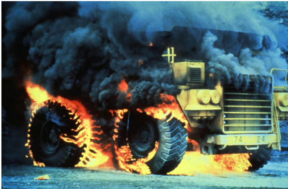
Figure 7. A large surface vehicle fire

Research continued at a fast pace throughout the 1970's, concentrating on the detection, control, and extinguishment of mine fires. In the area of mine fire detection, spontaneous combustion studies were made to understand the low temperature oxidation mechanism for early detection. This also included the development of tube bundle systems for sampling worked-out areas, and the evaluation of various gas indices to understand the state of a mine fire. These indices are routinely used today at mine fires as guides for rescue and re-entry. The first generation of submicron smoke and metal oxide detectors were developed. Contract research evaluated the adequacy and equivalency of fire detection and suppression systems for belt entries. Research was also conducted in-house and through contracts to understand the spread of fire contaminants through the mine ventilation system and the effect of fire size and ventilation on contaminant spread. One of the products of this research was the MFIRE mine fire ventilation code, still in use today (Greuer 1977).