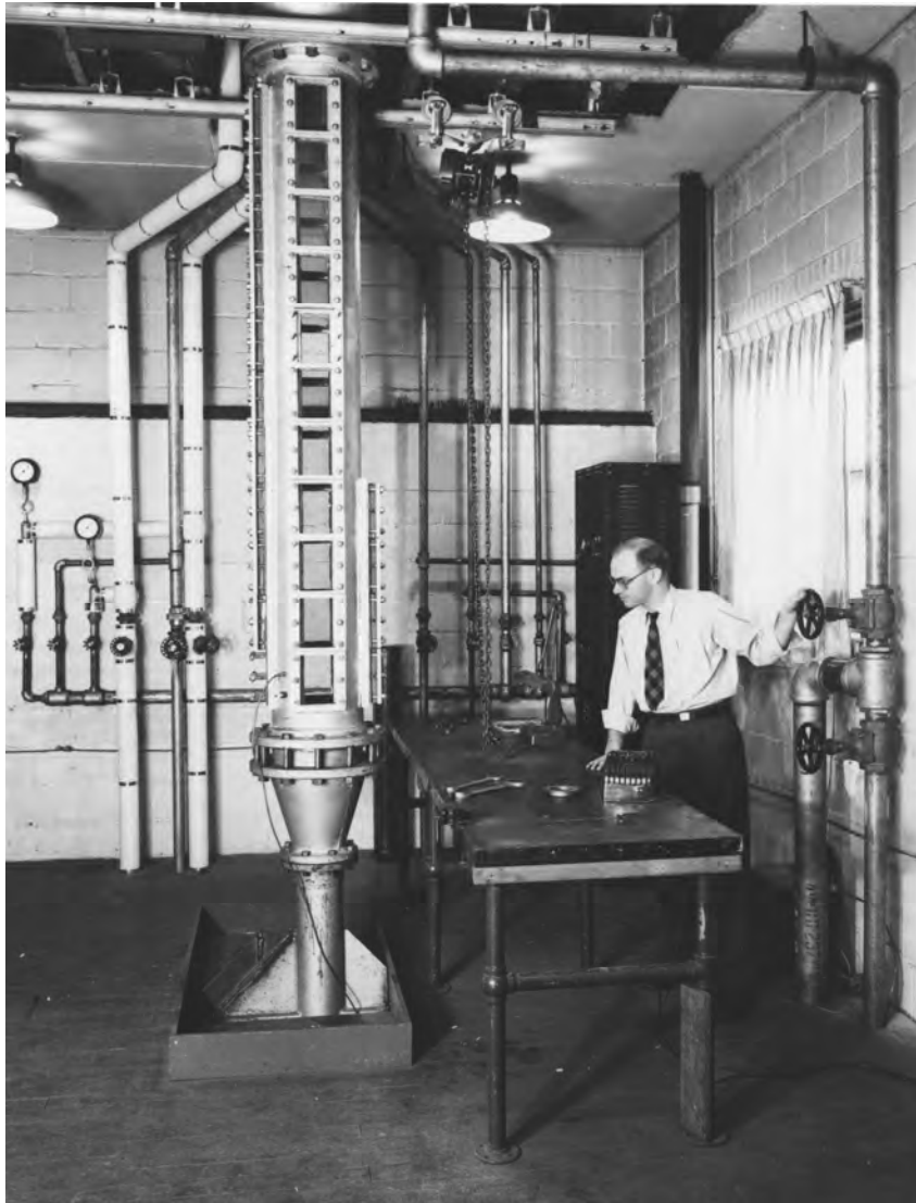
Figure 6. An apparatus to measure turbulent flame structure