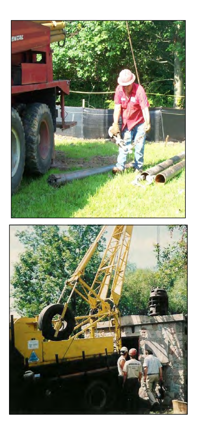
Case 2: A crew was preparing to remove a pump from a well when the hoist boom contacted a 4160-volt power line. The hoist operator was electrocuted.

OSHA Regulation - 29 CFR 1910.333 (c)(3)(iii)(A) (summarized) Power lines up to 50,000 volts – keep equipment at least 10 feet away, plus an additional 4 inches for every 10,000 volts above 50,000.