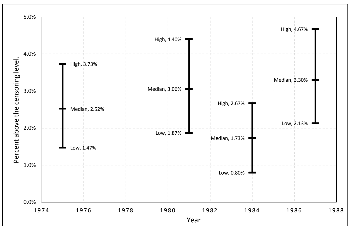
Figure 3-2. Percent of airborne concentration levels above the censoring level. (DuPont 1975a to 1975e, 1981a to 1981f, 1984c to 1984g, 1987b to 1987d).

Based on the statistical confidence intervals themselves and the consistency between them, there is no indication that additional sampling is necessary in order to draw a conclusion from this data. With indications that more than 95% of the air samples SRS collected in thorium work areas were below the censoring level of 1 \times 10^{-12} \mu Ci alpha/cm<sup>3</sup> (2.22 dpm/m<sup>3</sup>), the censoring level is considered to be a bounding estimate of the potential airborne concentration to which a worker might have been exposed.