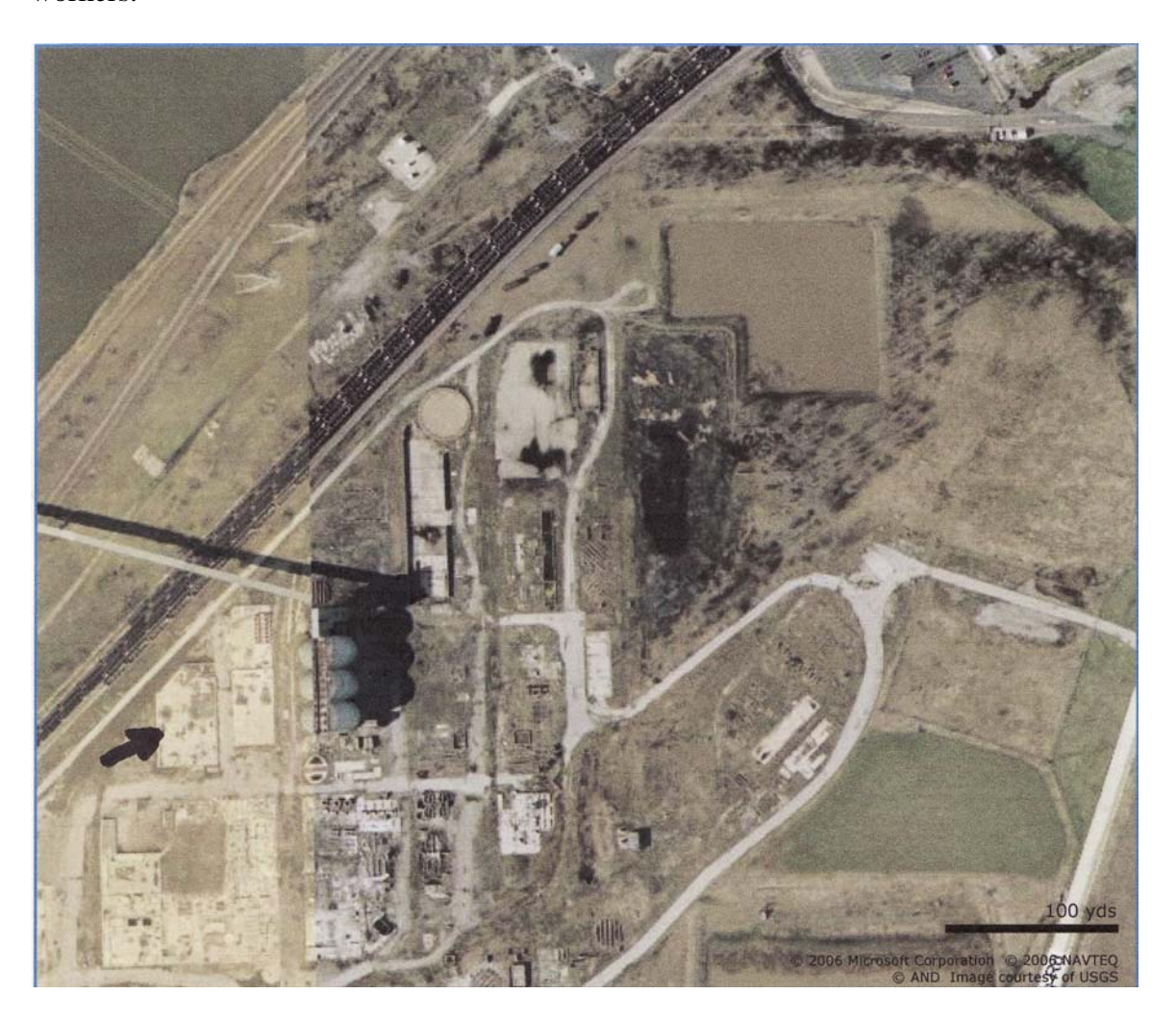
Figure 2-1: Aerial Photo of Blockson Chemical Company Site, Building 55 marked with Arrow

have become airborne and accumulated in and around Building 55, resulting in increased radon exposures. However, no evidence supporting this conjecture has been found. As discussed in the next section, soil samples taken not only around Building 55, but also across the property, do not exhibit significant increases in Ra/U ratios over those expected from the feedstock to the process. Since Ra is concentrated in the tailings along with the Ca from the phosphate rock concentrate, high Ra/U ratios might indicate mobilization and transport of tailings from the storage areas. No such evidence was found by ANL (DOE 1983). For example, two samples were taken from the roof gravels on Building 55—a likely place for any accumulations from airborne mobilization. Samples 4-S1 and 4-S2 had Ra/U ratios of 0.11 and 0.32, respectively. These ratios are less than those for the rock concentrate fed to the process, indicating that tailings mobilization and transport would not be a measurable contributor to the dose of Building 55 workers.