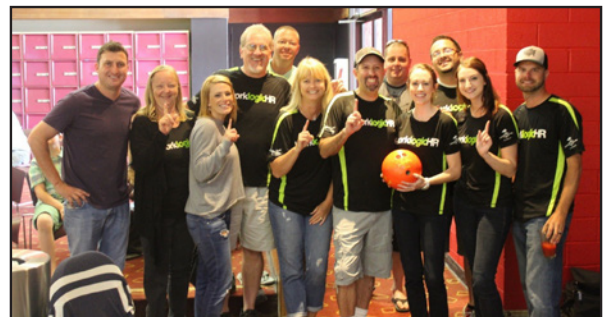
The Worklogic HR team bonds over bowling at the Kern County Corporate Challenge.

Worklogic increased its score for the Organizational Supports module, which assesses the extent to which organizations have a foundation and an infrastructure in place to support and maintain a workplace health-promotion program. Worklogic’s 2015 ScoreCard reflected that it now has a health promotion committee, offers health risk assessments, uses competitions to support employees’ behavior changes, provides flexible work-scheduling options, has an annual health promotion budget, and sets annual organizational objectives for health promotion while maintaining the strong leadership support it has had all along.