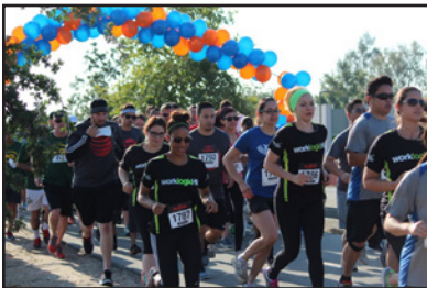
Worklogic employees participating in 5k run.

The centerpiece of Worklogic's wellness program is the company's participation in the Kern County Corporate Challenge—an Olympic-style competition for local business teams. The Corporate Challenge was a great outlet for Worklogic employees' competitive energy and inspired plenty