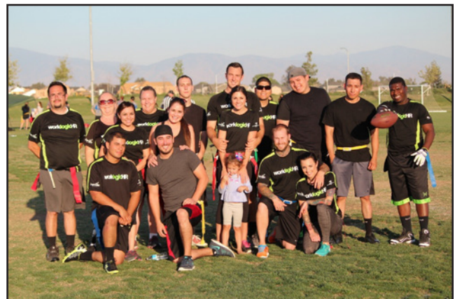
The Worklogic HR flag football team at the Kern County Corporate Challenge.

Most employees (81%) agreed that they support the environmental changes that create a safe and healthy culture at Worklogic, as well as changes in policies as a result of Worklogic’s healthy worksite program. The majority of employees (78%) who completed the 2015 assessment agreed that they were well informed about the health and wellness opportunities at Worklogic and 59% agreed that the worksite health program adds value to their job. The wellness committee is continuing to encourage employee participation in the various wellness initiatives, and employees are continuing to eat healthier and engage in more physical activity. It often takes longer to effect certain outcomes, such as weight loss—but if Worklogic continues its commitment to promoting employee well-being, they are likely to see improvements in more areas in the coming years.