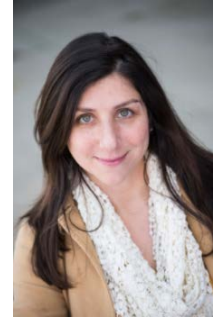
Outreach & Health Promotion