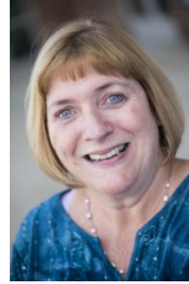
Disability Policy & Training