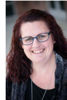
Senior Program Support