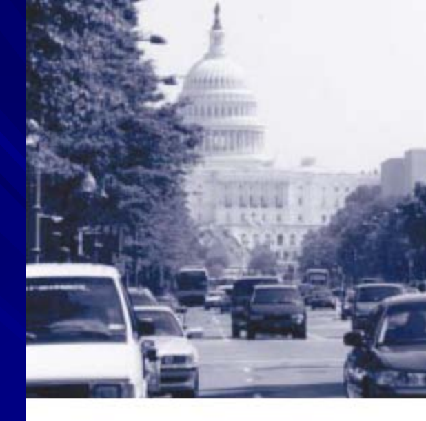
Promote Healthy and Safe Communities