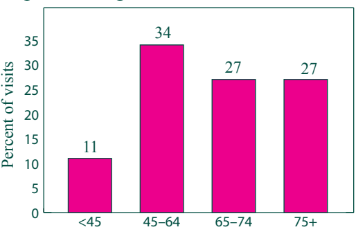
Patient's age in years

Percent distribution of office visits by patient's age: 2010