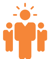
Figure. Strategies for Recess in Schools