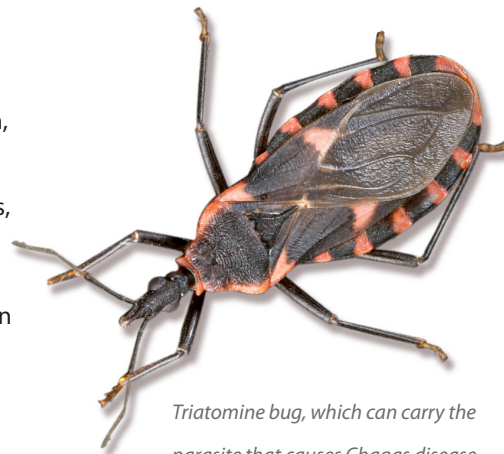
Triatomine bug, which can carry the parasite that causes Chagas disease.