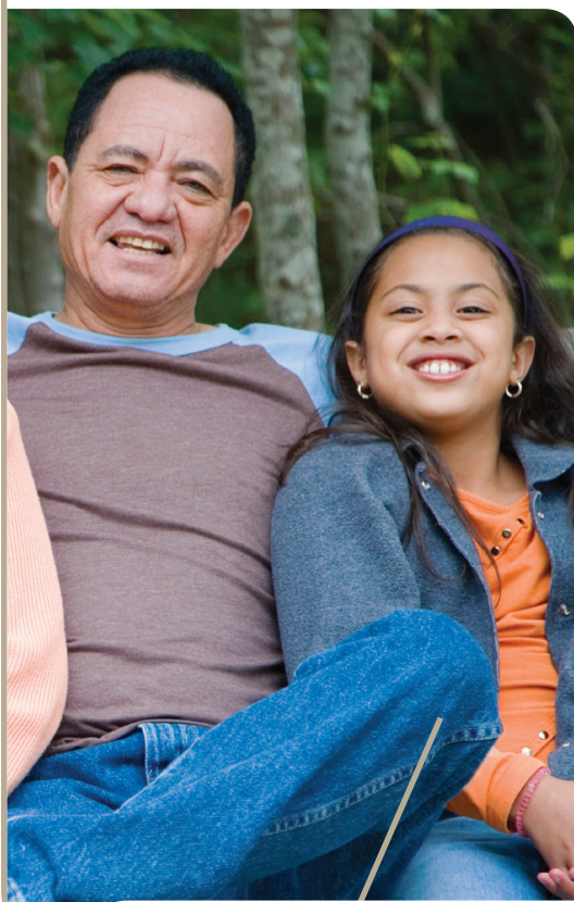
Center for Global Health Division of Parasitic Diseases and Malaria

Chagas disease primarily affects individuals from endemic areas (Mexico, Central America, or South America) who acquired the infection before arriving in the United States. Children born to infected mothers are at risk for congenital transmission of Chagas disease.