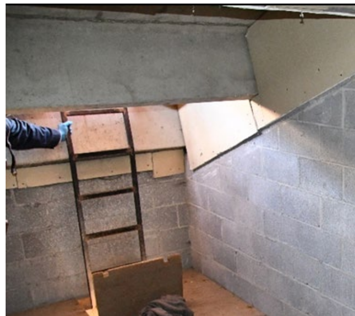
Photograph of the building's attic. The fixed black metal ladder extended from the scuttle-hole on the ceiling of the fourth-floor to the roof access hatch.