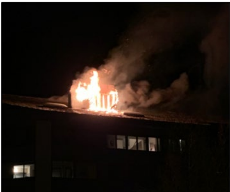
Chimney chase fire as seen from Side Charlie/Delta corner.