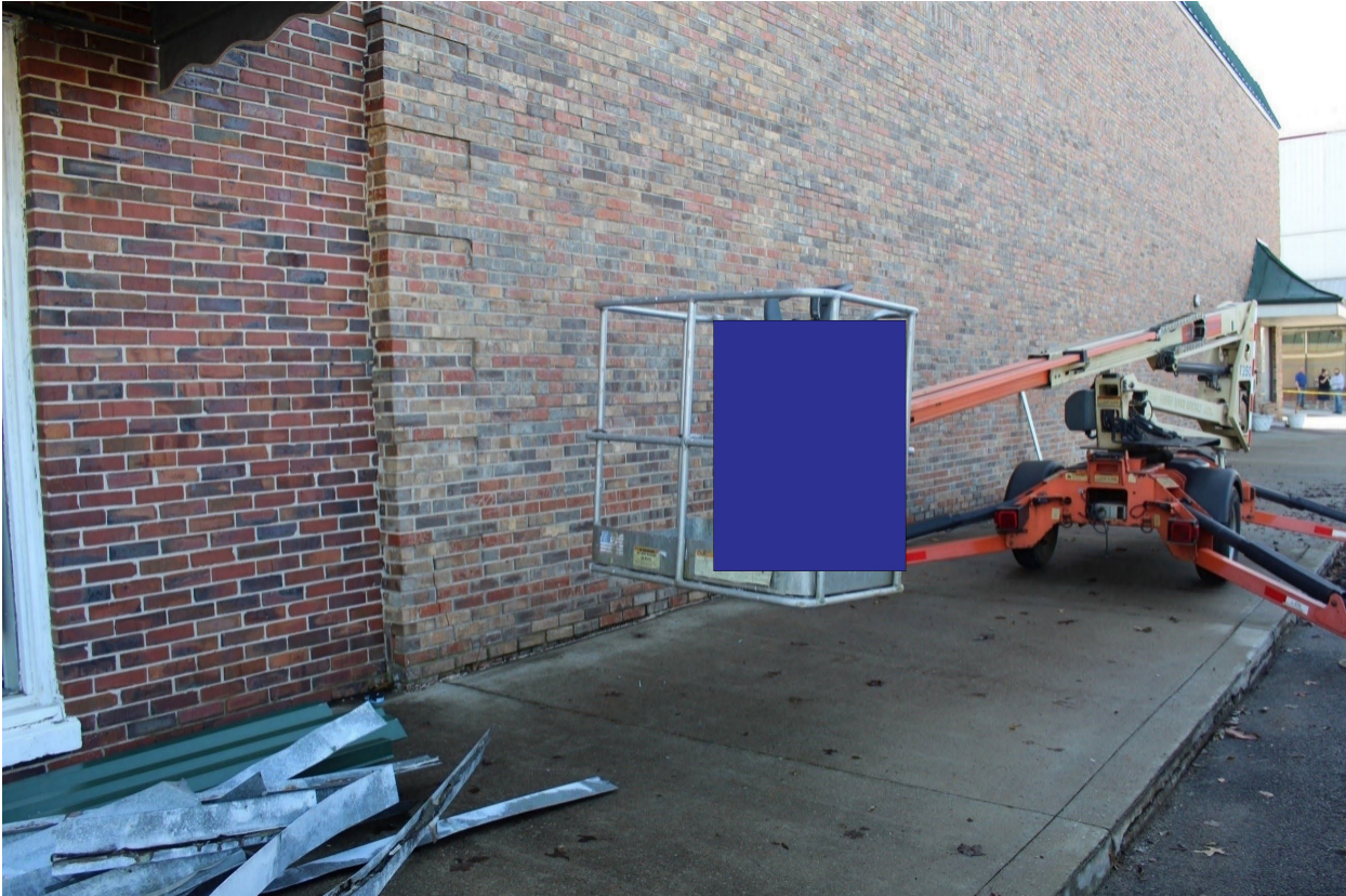
Image 6: Boom lift position; sidewalk facing west (Property KY FACE)

Kentucky Injury Prevention and Research Center Bona fide agent for Kentucky Department for Public Health 333 Waller Avenue, Suite 242 • Lexington, KY 40504 • 859-257-5839