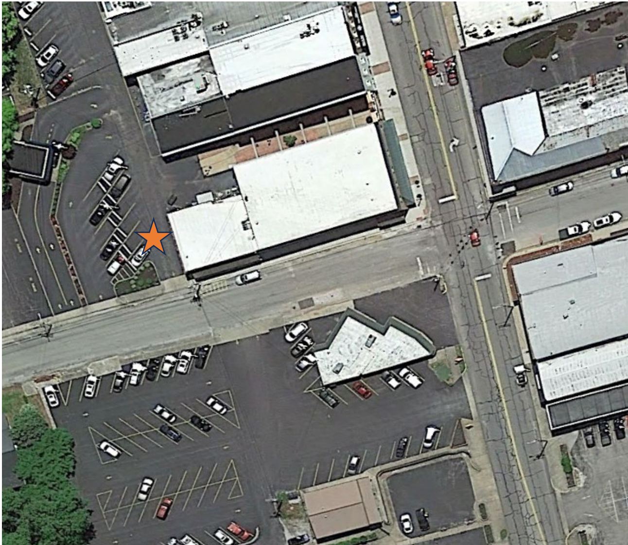
Image 7: Incident scene; aerial view. The orange star indicates the rear parking lot. (Google Earth Pro, 2023.)

Kentucky Injury Prevention and Research Center Bona fide agent for Kentucky Department for Public Health 333 Waller Avenue, Suite 242 • Lexington, KY 40504 • 859-257-5839