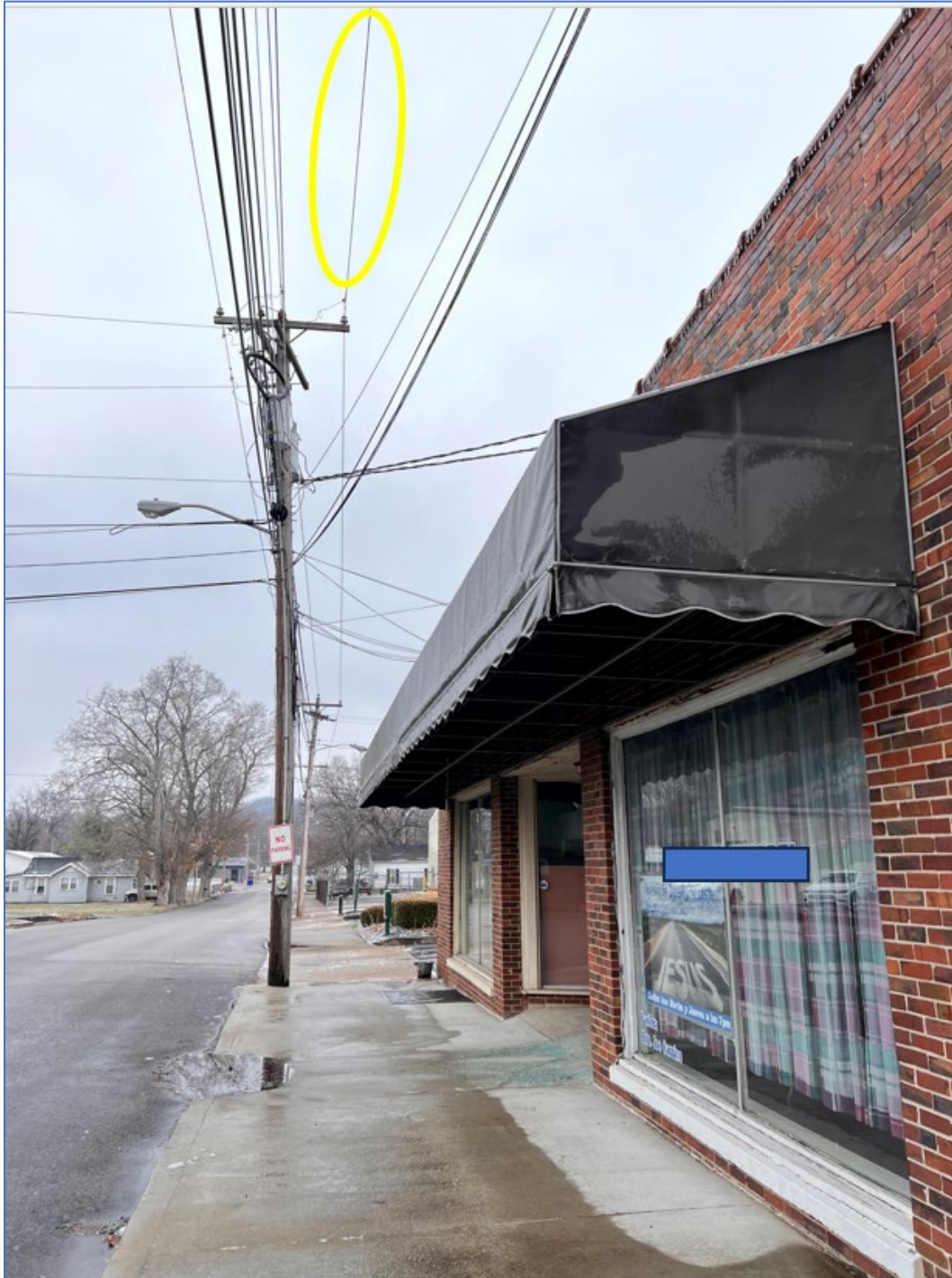
Image 5: Incident scene with overhead wires; sidewalk facing west. The yellow circle shows where the overhead power line contacted the worker during the incident. (Property KY FACE.)

Kentucky Injury Prevention and Research Center Bona fide agent for Kentucky Department for Public Health 333 Waller Avenue, Suite 242 • Lexington, KY 40504 • 859-257-5839