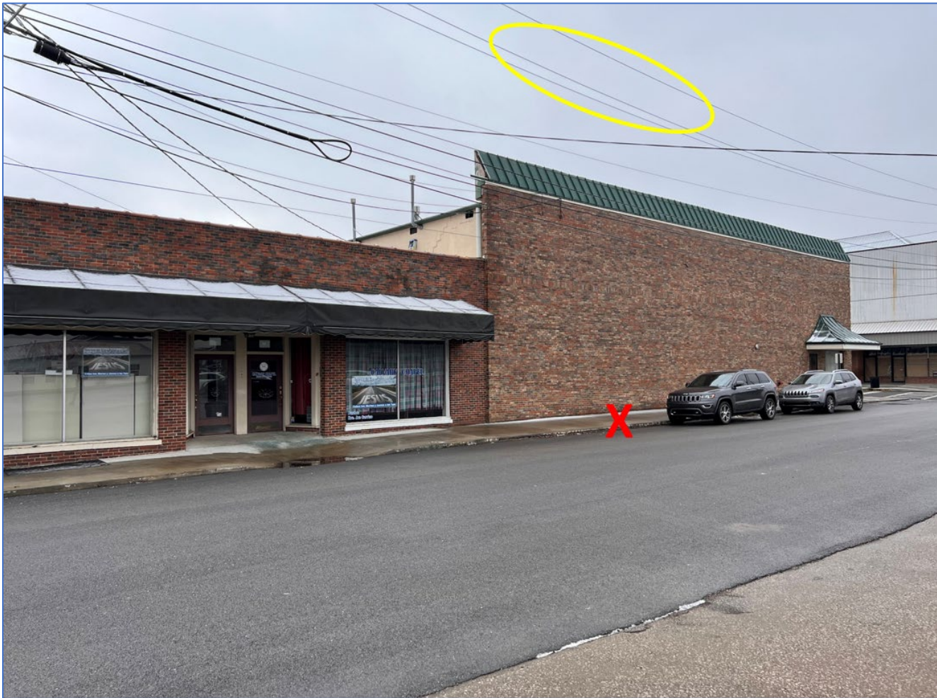
Image 4: Incident scene with overhead wires; facing south. The yellow circle shows the approximate location where the roofer contacted the overhead power lines. The red “x” indicates the approximate location of the boom lift.

Kentucky Injury Prevention and Research Center Bona fide agent for Kentucky Department for Public Health 333 Waller Avenue, Suite 242 • Lexington, KY 40504 • 859-257-5839