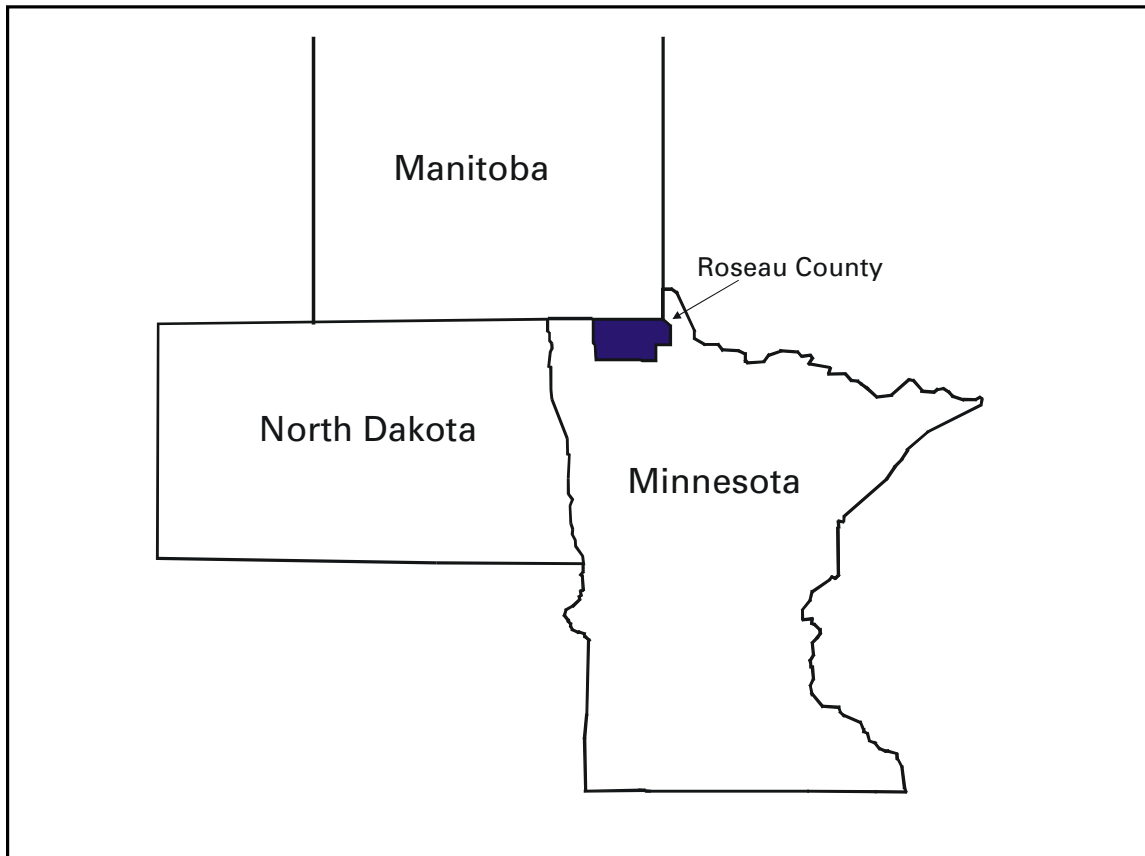
FIGURE 1. Location where Bacillus anthracis has been isolated from steer carcasses — Roseau County, Minnesota, North Dakota, and Manitoba, Canada, 2000

possible interventions range from close observation to antibiotics alone to antibiotics with vaccination, because the family was at high risk for anthrax infection, management consisted of an extended course of ciprofloxacin combined with administration of anthrax vaccine.