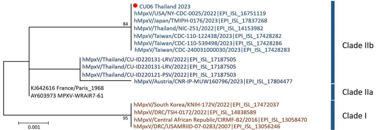
Appendix Figure. Phylogenetic analysis of the DNA helicase gene region (position 123,565–123,898 nt). The phylogenetic tree was constructed using the neighbor-joining method with 1,000 bootstrap replicates and implemented in MEGA version 7 ( www.megasoftware.net ). Evolutionary distances were computed using the maximum composite likelihood method. Bootstrap values >75 are shown. Scale bar represents substitutions per site.