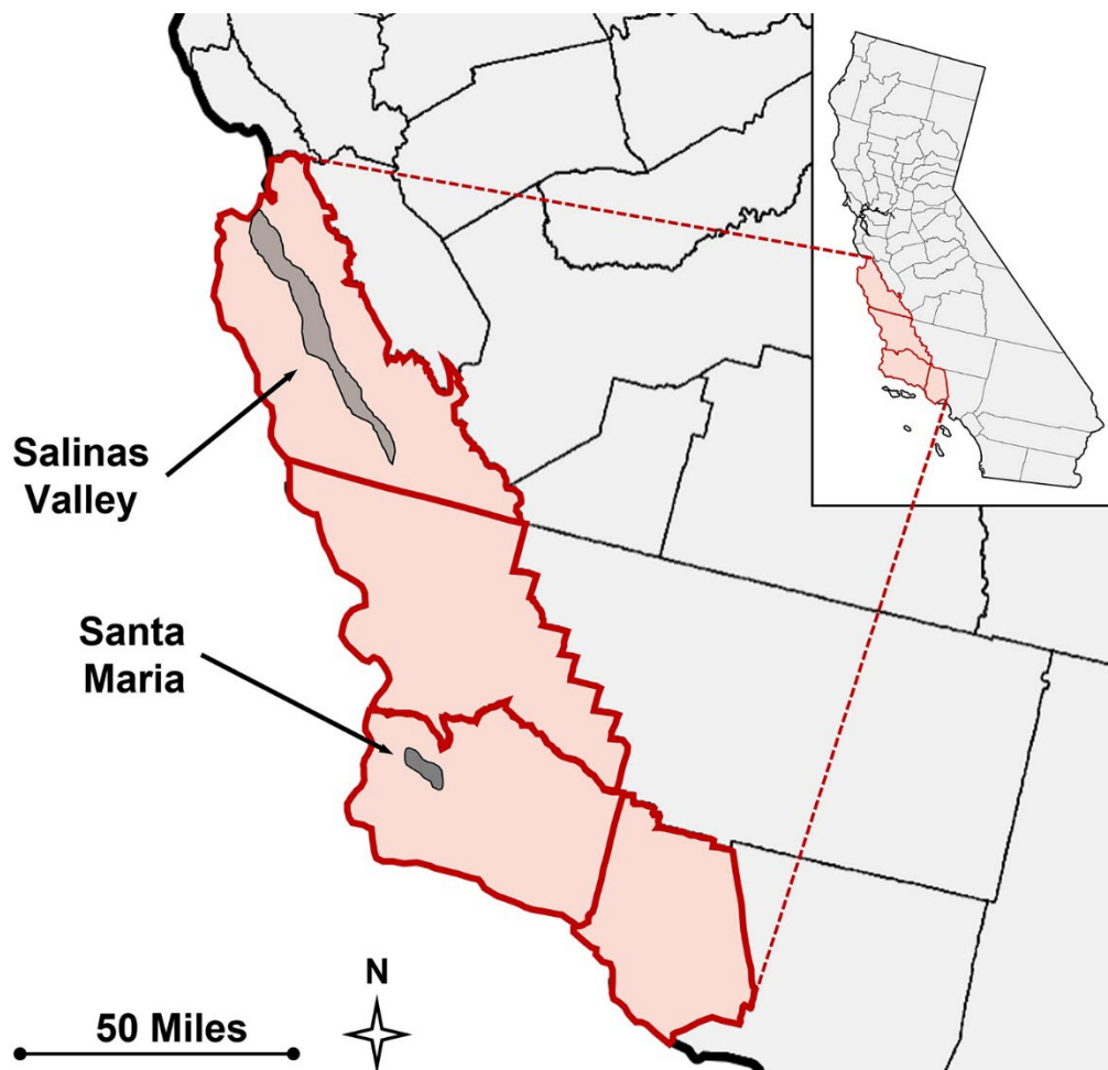
Appendix 2 Figure. Map illustrating growing regions in California, USA, of which some REPEHX02-linked illnesses are associated with. More specifically, outbreak A in this study was traced to romaine lettuce from Salinas Valley, California, while traceback and sampling in outbreak B2 linked some illnesses to romaine lettuce from Santa Maria, California, both labeled and shaded in grey on the map.