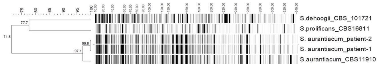
Appendix Figure 2. Amplified fragment length polymorphism of isolates from both patients, S. aurantiacum CBS (Centraalbureau voor Schimmelcultures) 11910, Lomentospora prolificans CBS 16811, and S. dehoogii CBS 101721.