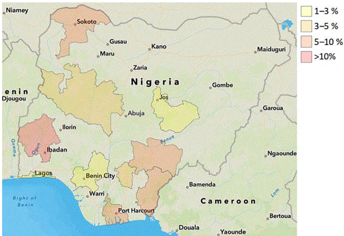
Appendix Figure. Geographic variation in histoplasmosis prevalence from study of prevalence of histoplasmosis among advanced HIV disease patients in Nigeria.